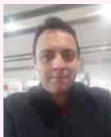
Dr Alok Sharma UK