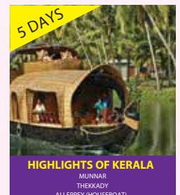
HIGHLIGHTS OF KERALA MUNNAR THEKKADY ALLEPPEY (HOUSEBOAT)