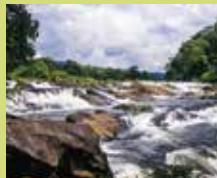
Athirappilly - Vazhachal