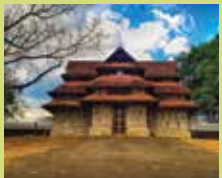
Vadakkunnathan Temple Thrissur