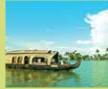
Alleppey / Kumarakom - The Backwaters