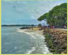
Fort Kochi & Cherai Beach

Plan a holiday in God's Own Country along with the Conference!!